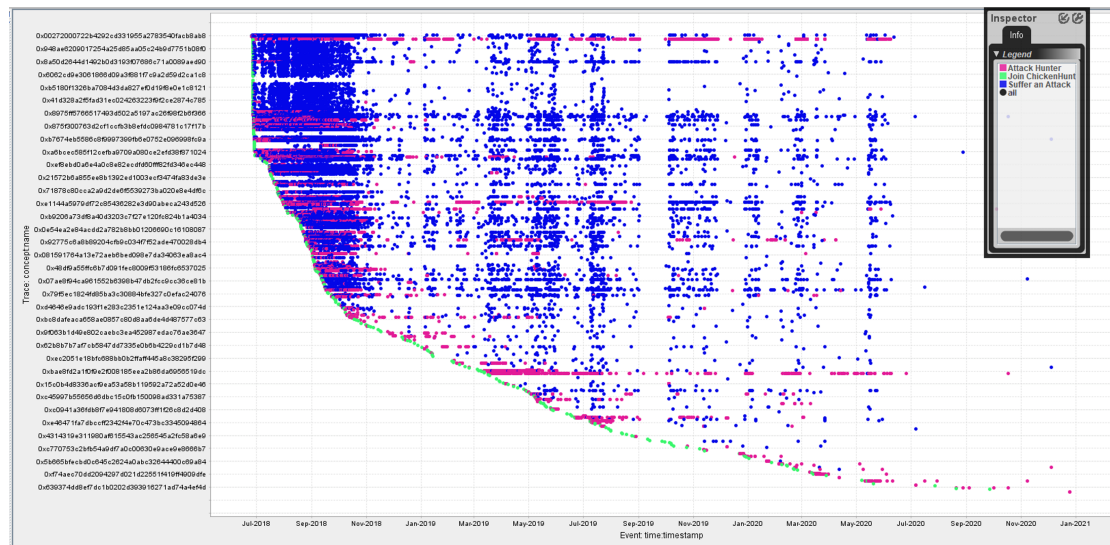
Figure 2: Dotted chart: ChickenHunt attack behavior.

but here we focus on results obtained with ProM. In Fig. 1a, the most common behavior of players is shown: 107 players out of the 715 cases join chicken hunt and never did anything else. Several frequent traces show players joining, and then being attacked (one or more times) without doing anything else. Some players follow a similar pattern, but first they succeed with bringing chickens to the altar. These insights could help understand why players stop early, and be used by the developers when working on improvements to promote the user base to grow.